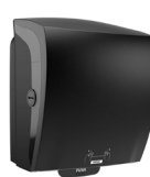
82070 Katrin Plastic Dispenser For System Paper Towel Roll, Black