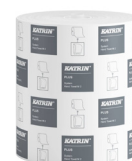
82537 Katrin Plus Dispenser Paper Towel Roll System