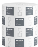
460058 Katrin Plus Dispenser Paper Towel Roll System Medium 2-Ply