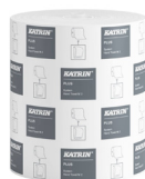
57795 Katrin Plus Dispenser Paper Towel Roll System Medium 2-Ply