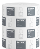
38015 Katrin Plus Dispenser Paper Towel Roll System M 3-Ply